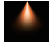
2700K SOFT WHITE LIGHT