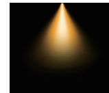
3000K WARM WHITE LIGHT