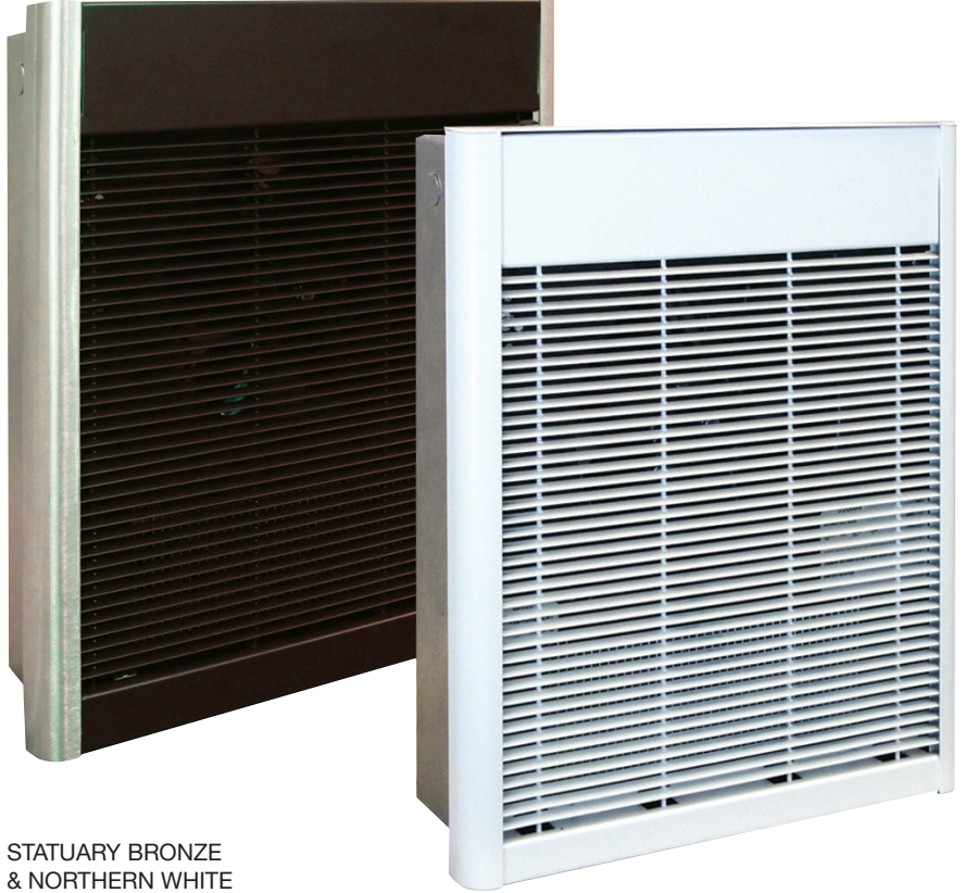
STATUARY BRONZE & NORTHERN WHITE