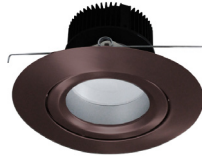
Oil Rubbed Bronze