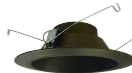
Oil Rubbed Bronze