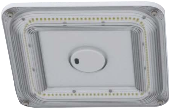
DLC Primary Use = Parking Garage Luminaires 160° lens version comes with a clear louvered lens