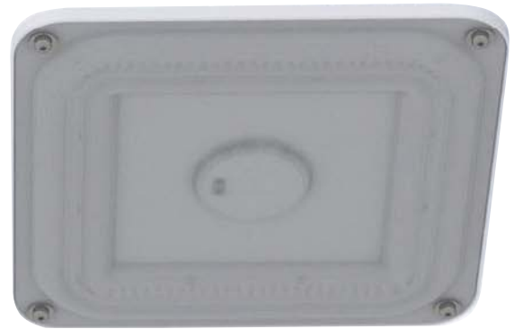
DLC Primary Use = Fuel Pump Canopy Luminaires 120° lens version comes with a frosted lens

Specifications and dimensions subject to change without notice.