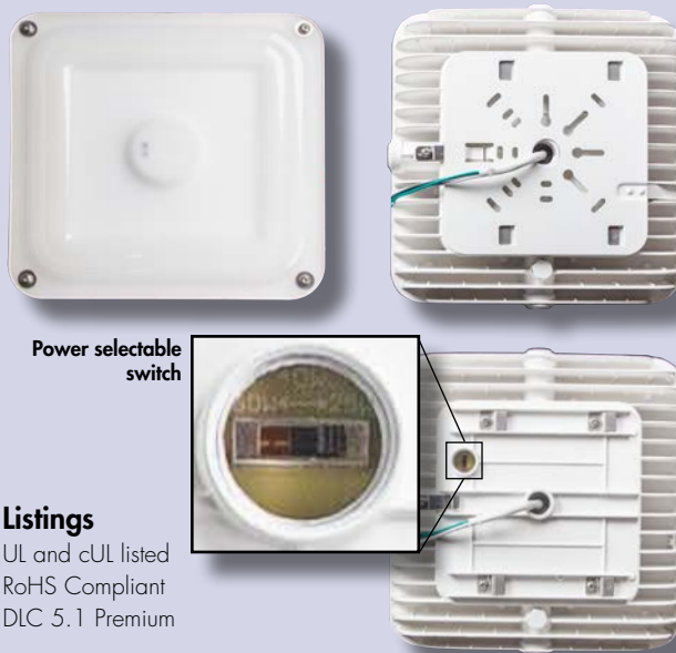
Power selectable switch